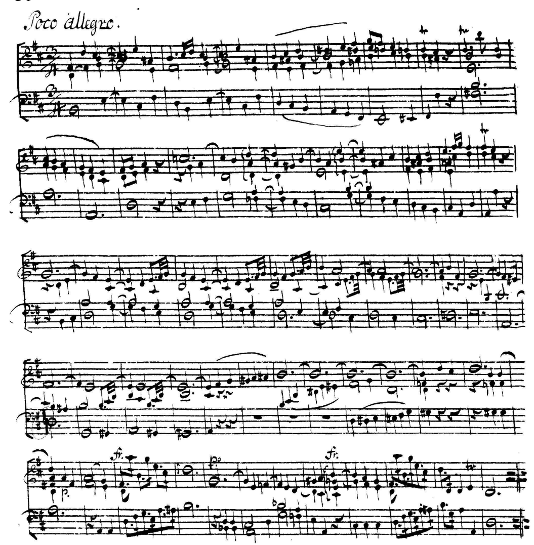
3. C. P. E. Bach, Sonata in B minor, W. 65/13 (H. 32.5), first movement, from Staatsbibliothek zu Berlin, Mus. ms. Bach P 775; facsimile in Berg, Collected Works , 3:260

contrary motion; the right hand, moreover, contains the same figure in parallel sixths (ex. 3). Similar gestures appear in other works from the same decade.<sup>37</sup> A true legato is difficult enough to achieve on a keyboard instrument lacking a damper pedal; harpsichordists today often employ over-legato to this effect, but the presence of parallel thirds or sixths within one hand makes it difficult to apply this technique to both voices. Such gestures are more practicable on the clavichord, where the absence of a sharp plectrum attack and the possibility of voicing individual notes of a chord through dynamics makes it possible to disguise non-legato attacks. This strengthens the impression of legato in such passages, especially when the instrument has good sustaining powers.