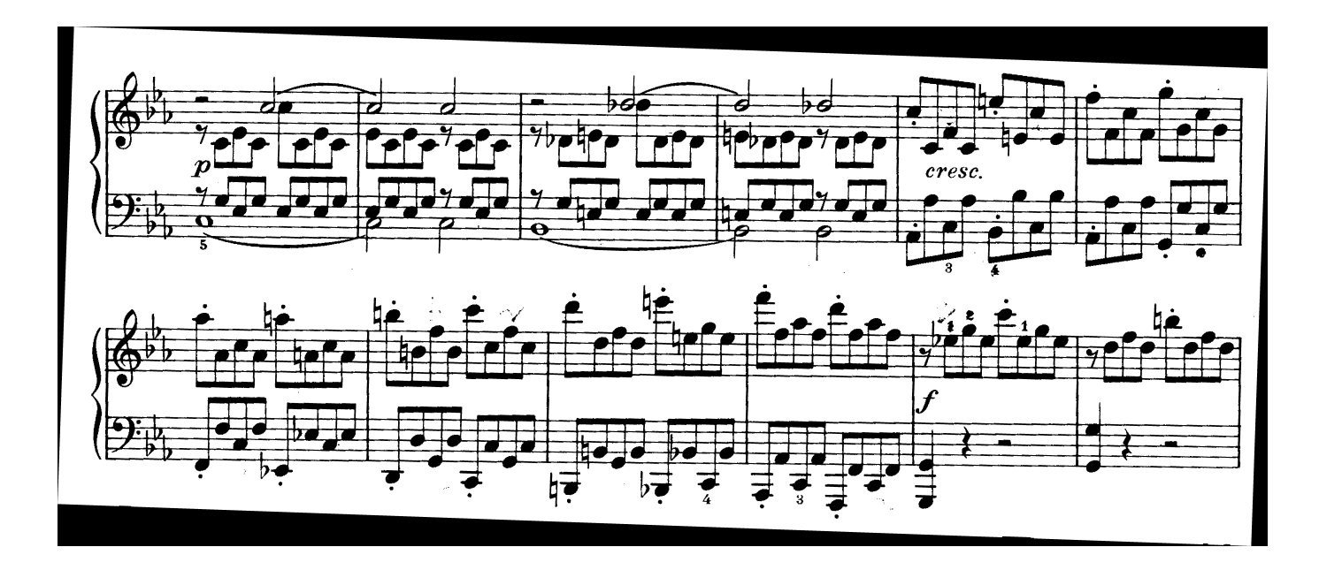
(b) broken-chord figuration (compare the second measure in Figure 9a above)