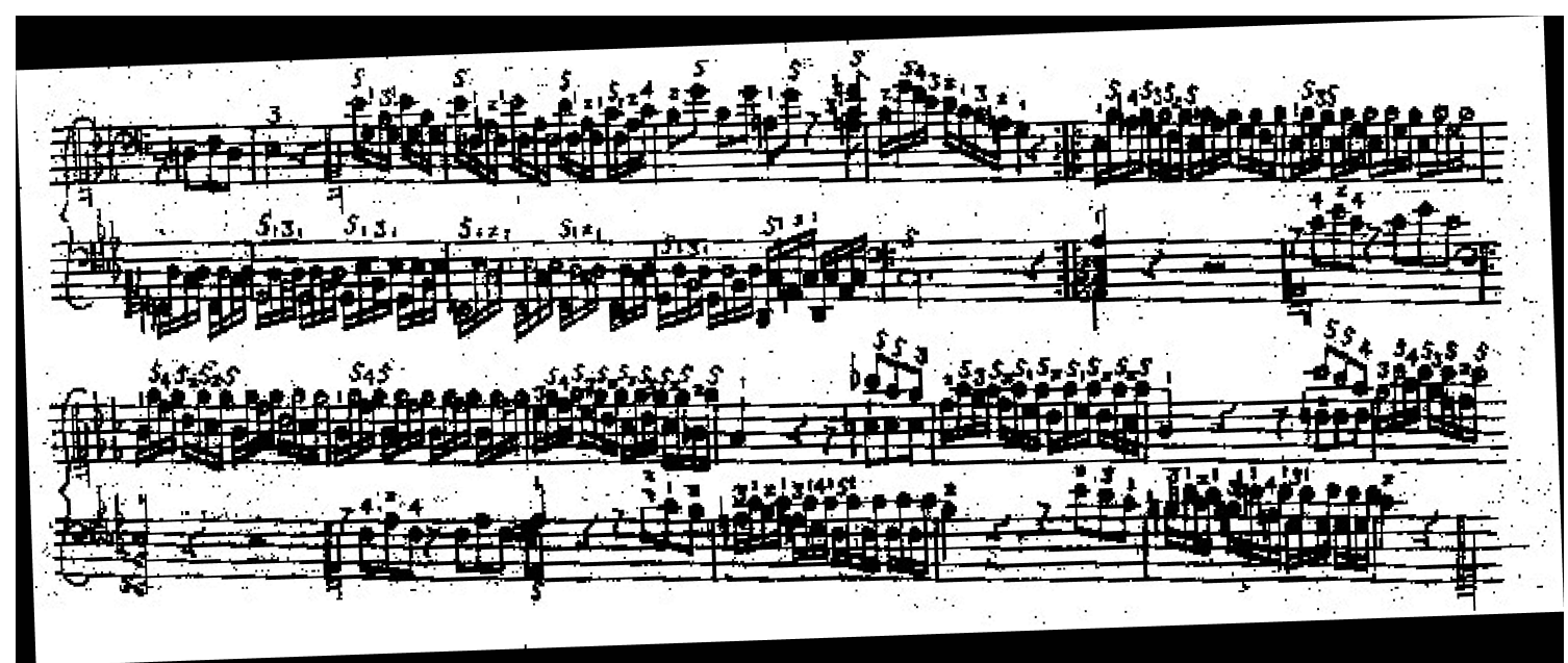
Fig. 9. Sonata VI, mvt. 1, showing tranposition of m. 28 in US NHy LM 4813b