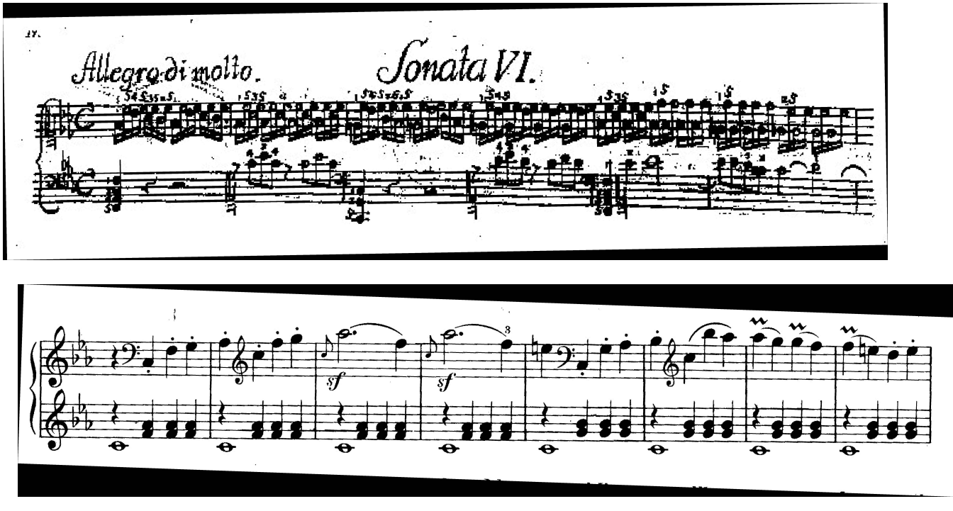
Fig. 10. Sonata VI, mvt. 1, and Beethoven, Sonata pathétique, op. 13, mvt. 1 (Vienna, 1799)