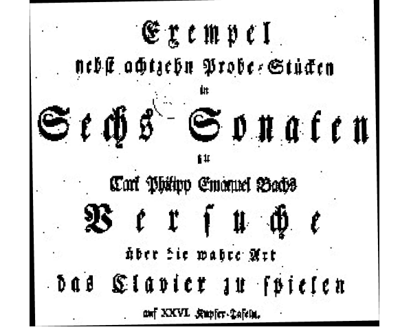
earliest version of title page