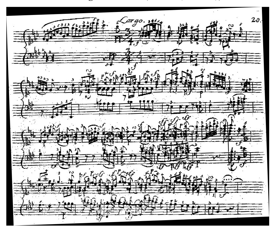
Fig 3. Sonata VI, mvt. 3 (fantasia), middle section